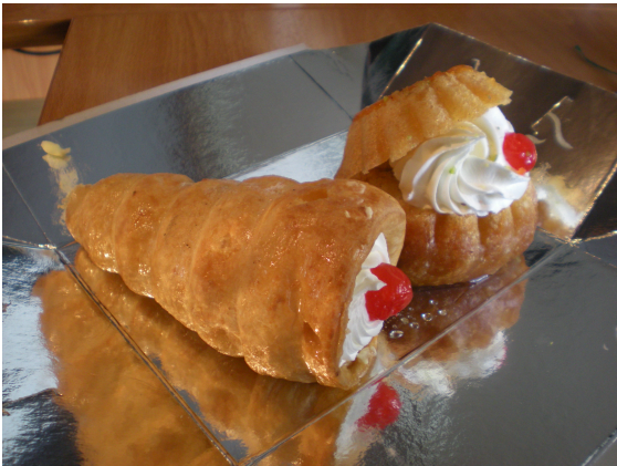
“Κορνές και Μπαμπάς”

She was given a similar wide berth on the walk back to her office, though she would swear some of the fearful looks had turned to pity. She closed the door behind her and reflexively made a set of gestures with her right hand to trigger her security measures. The walls, ceiling, and floor pulsed a bright red glow that settled across the doorway in an intricate glyph.